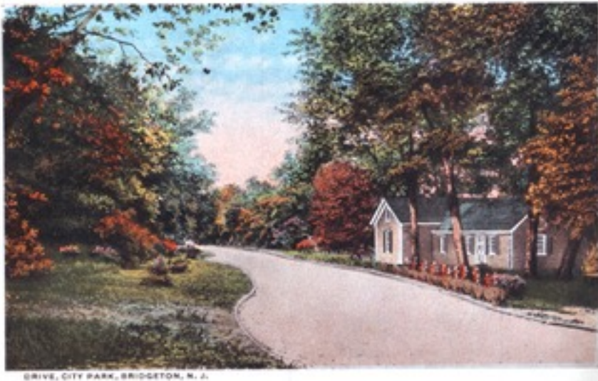
DRIVE, CITY PARK, BRIDGETON, N. J.